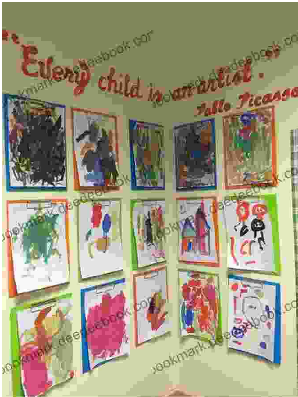
The Lunatic's Artistic Style