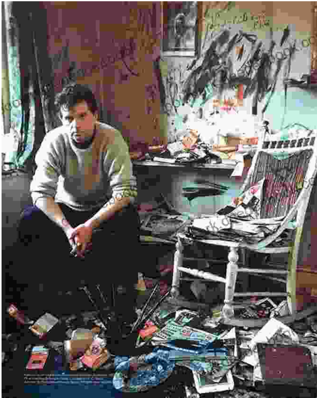
Capturing the Human Experience