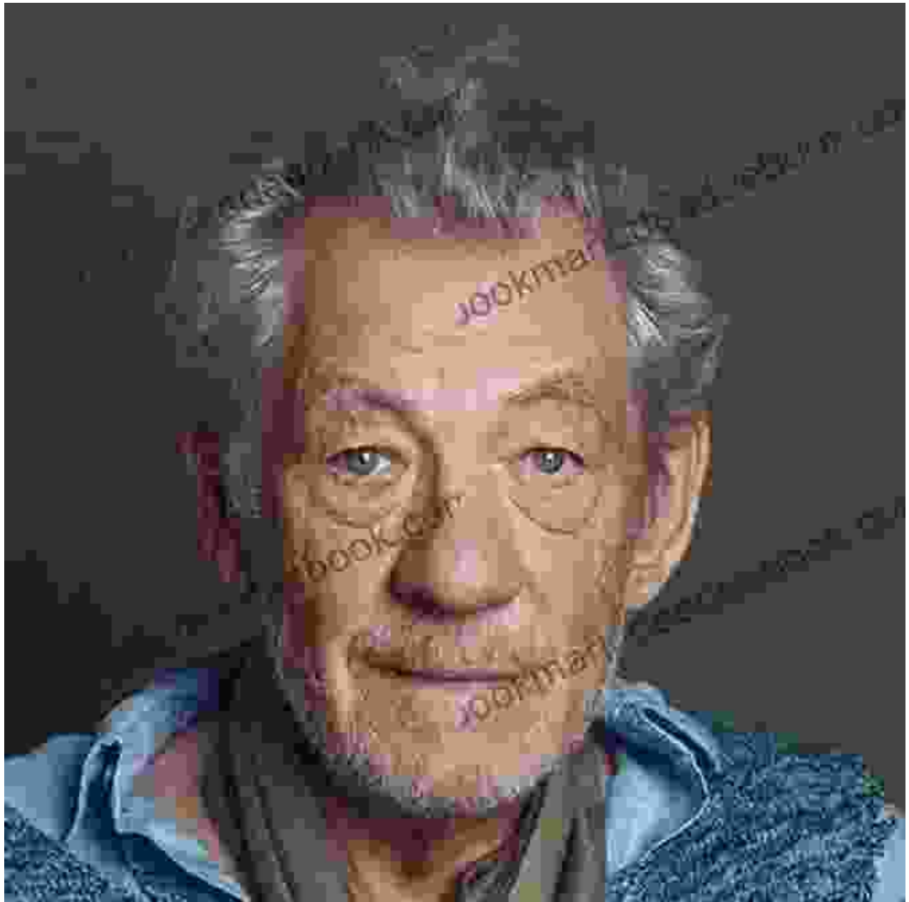
Kenneth Branagh (1960-present)

Shakespearean role, including Hamlet, Macbeth, King Lear, and Richard III. McKellen's interpretations are characterized by their intelligence, wit, and deep understanding of the text. He is also known for his pioneering work in LGBTQ+ representation in the theater, using his platform to advocate for social justice and equality.