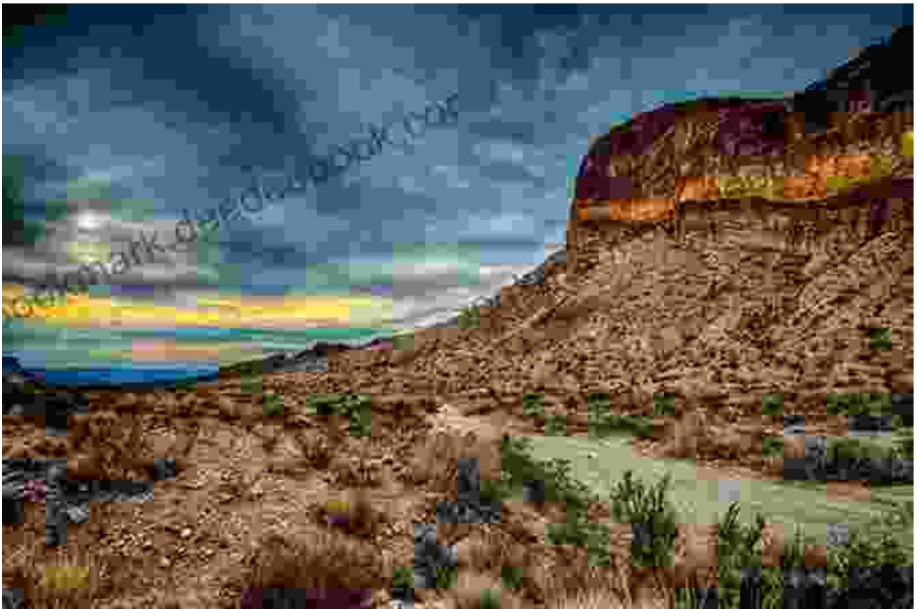
The rugged landscape of Big Bend National Park.