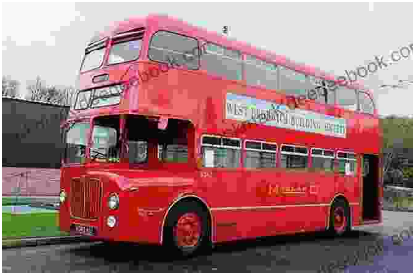
A Midland Red bus, one of the first rear-engined buses in the UK