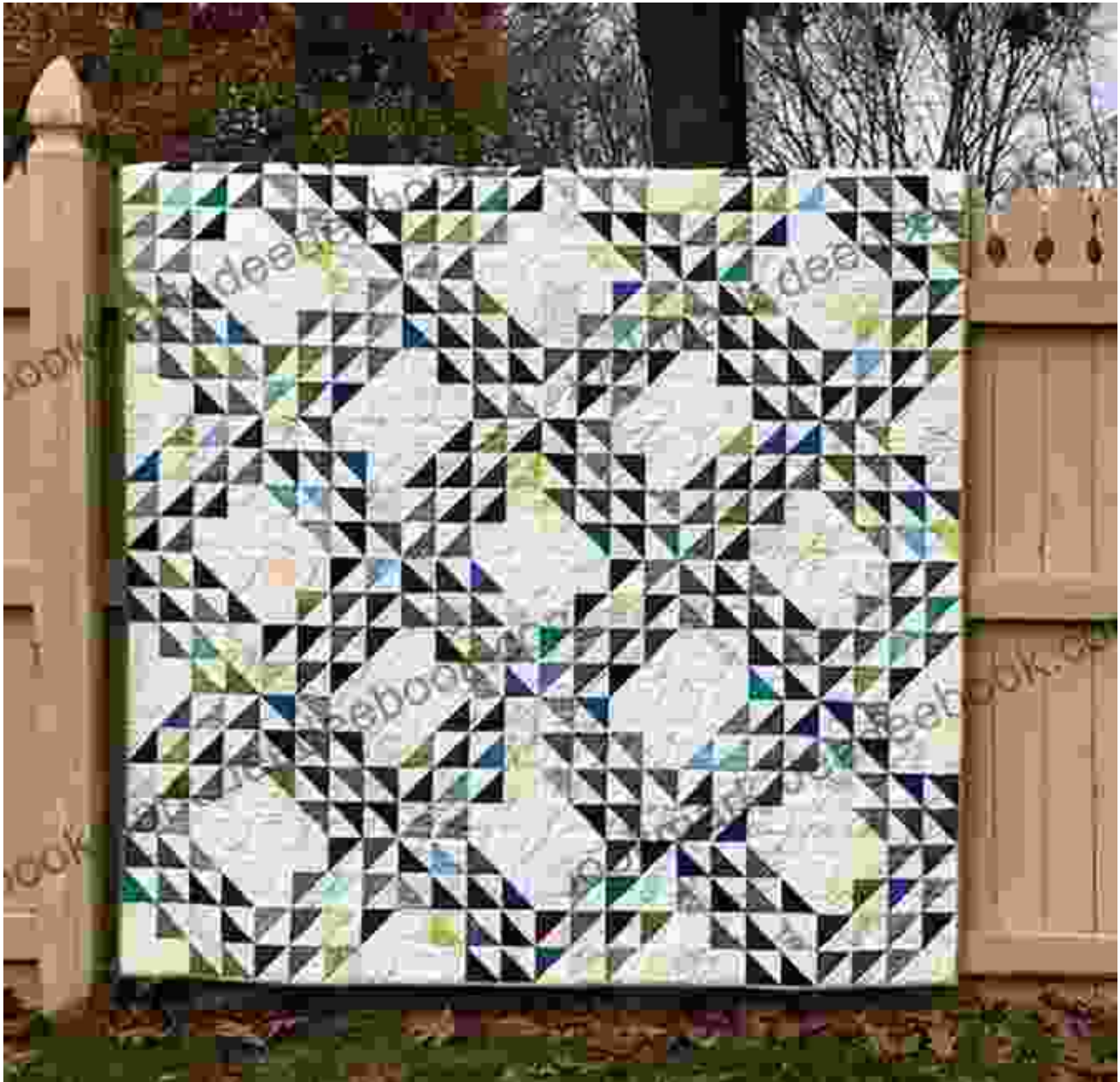
Autumn: Colors and Harvest

tranquility of ocean waves. Stitch together a patchwork tote bag, adorned with beachy motifs, to carry your essentials on summer outings. Craft a whimsical wall hanging featuring sailboats or seashells, bringing the coastal charm indoors.