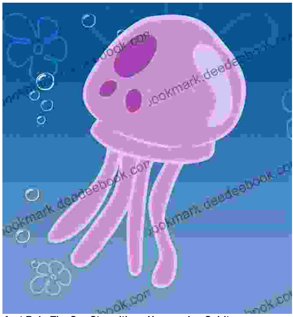
Starfoot Bob: The Sea Star with an Unwavering Spirit

Starfoot Bob is no ordinary sea star. With his vibrant orange body and intricate patterns, he stands out as a beacon of resilience and determination. Despite losing several of his arms in a battle with a predator, Bob remained undeterred. His ability to regenerate these limbs showcases the remarkable regenerative abilities of these marine creatures.