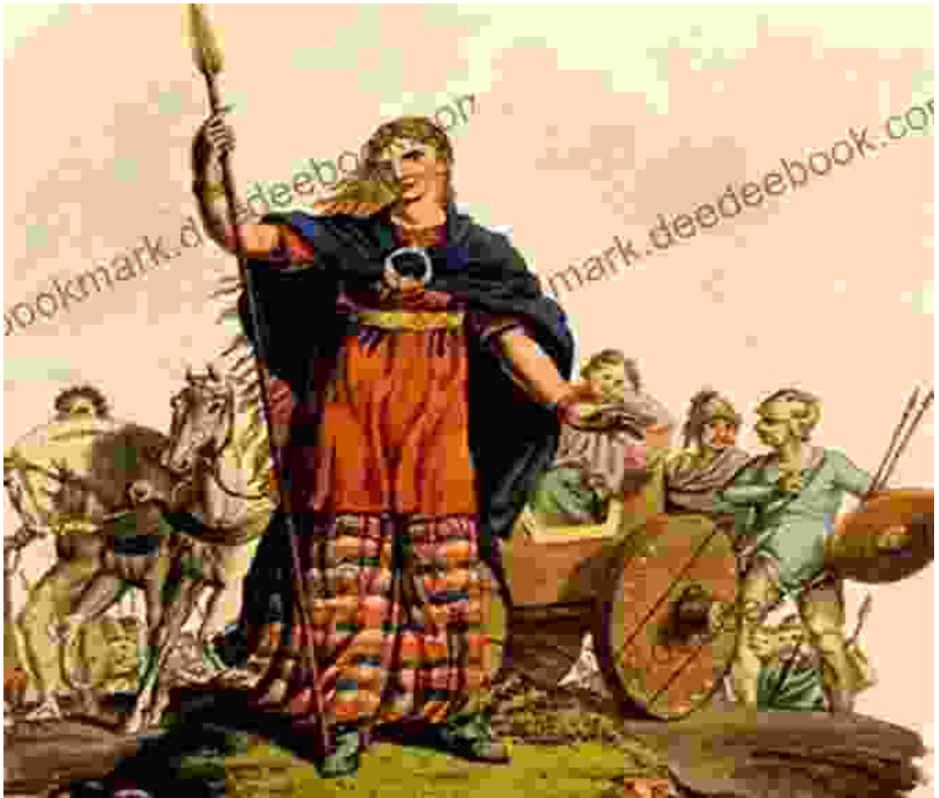
Boudicca rallying her Celtic warriors.