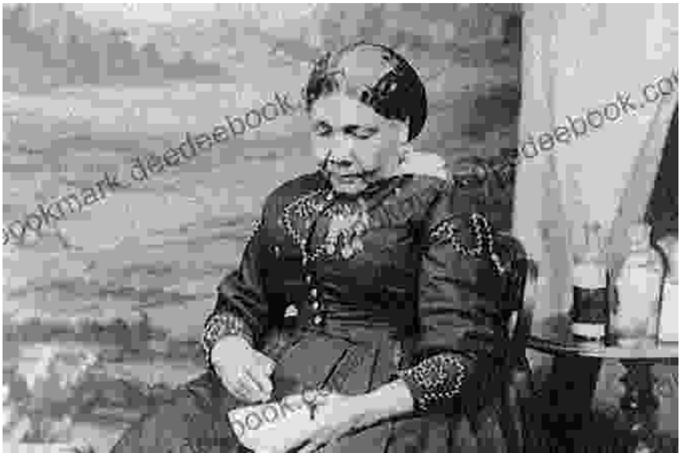
Mary Seacole arriving in Africa during World War II

Mary Seacole's journey to Africa was long and arduous. She traveled by ship from England to South Africa, a voyage that took several weeks. From there, she traveled by train and by car to reach her destination in what is now Zimbabwe. Along the way, she encountered numerous obstacles, including delays, shortages of supplies, and the threat of enemy action.